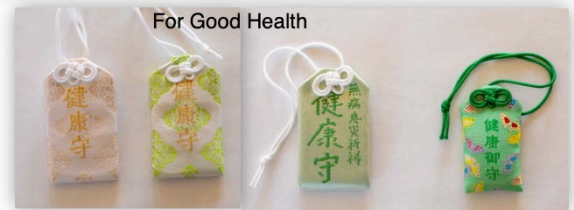
For Good Health