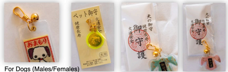
For Dogs (Males/Females)

Omamori will be sold after the New Year's Blessing Service in the social hall. The cost is $5 each. See the omamori available on the right and below.