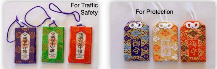
For Traffic Safety