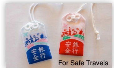
For Safe Travels