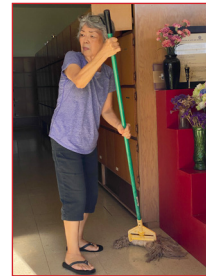
The Fujinkai Ladies during the monthly cleaning of the nokotsudo.